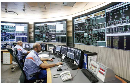
Alarm Monitoring Centers