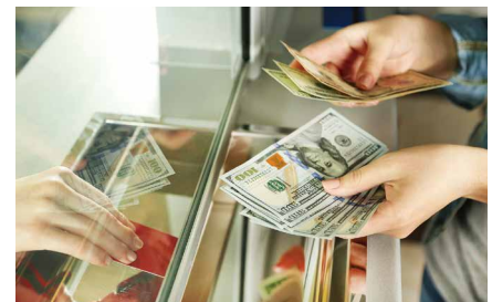
Banking & Finance